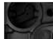
Pioneer Metal Finishing's EnduraGuard™

EnduraGuard™ - Offers unmatched corrosion protection in addition to an unparalleled, rich, shiny black finish. Fights filiform corrosion, and guards against acid and alkaline attacks. EnduraGuard is the elite aluminum die cast finish offered at Pioneer Metal Finishing.