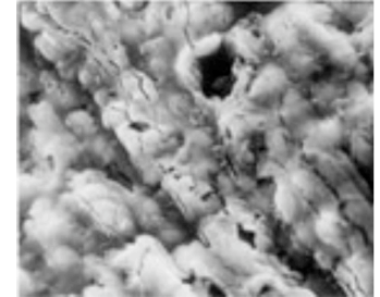
Microscopic view of surface pores in anodic coating.

The SCOGS Review Committee states about Aluminum: “Aluminum and its salts are found in varying amounts in nearly all foods. In addition to the aluminum occurring naturally in foods, man can be exposed to the aluminum added to foods, to that in aluminum antacids he may take, and to that from aluminum cooking vessels. “The Committee concludes a “Type 1 conclusion”: “There is no evidence in the available information on {substance (aluminum)} that demonstrates, or suggests reasonable grounds to suspect, a hazard to the public when they are used at levels that are no current or might reasonable be expected in the future.”